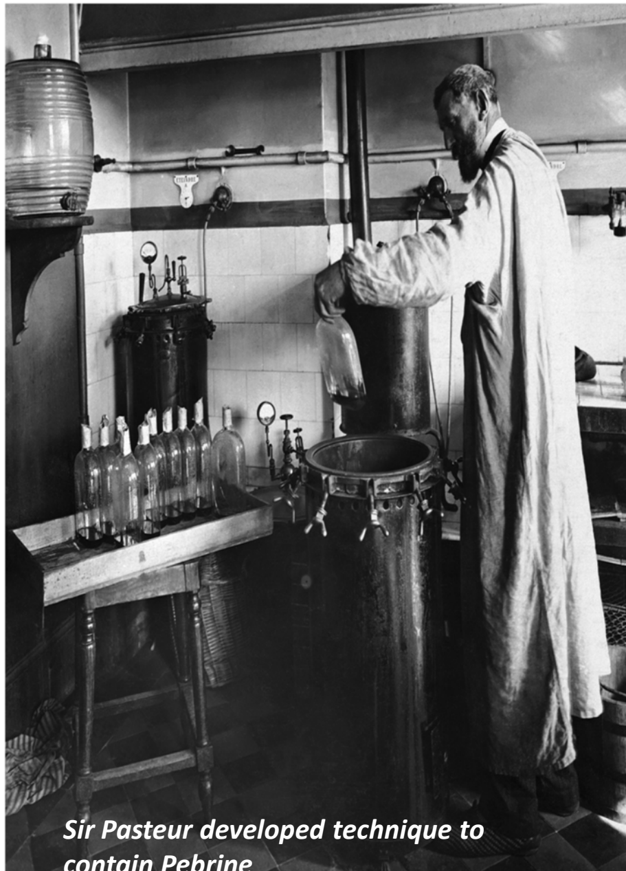
Sir Pasteur developed technique to contain Pebrine